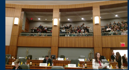
New Mexico Families at CAPE at the Capitol

Quality Education Parent-Directed Family-Funded Home-Based Time-Tested and PROVEN SUCCESSFUL!