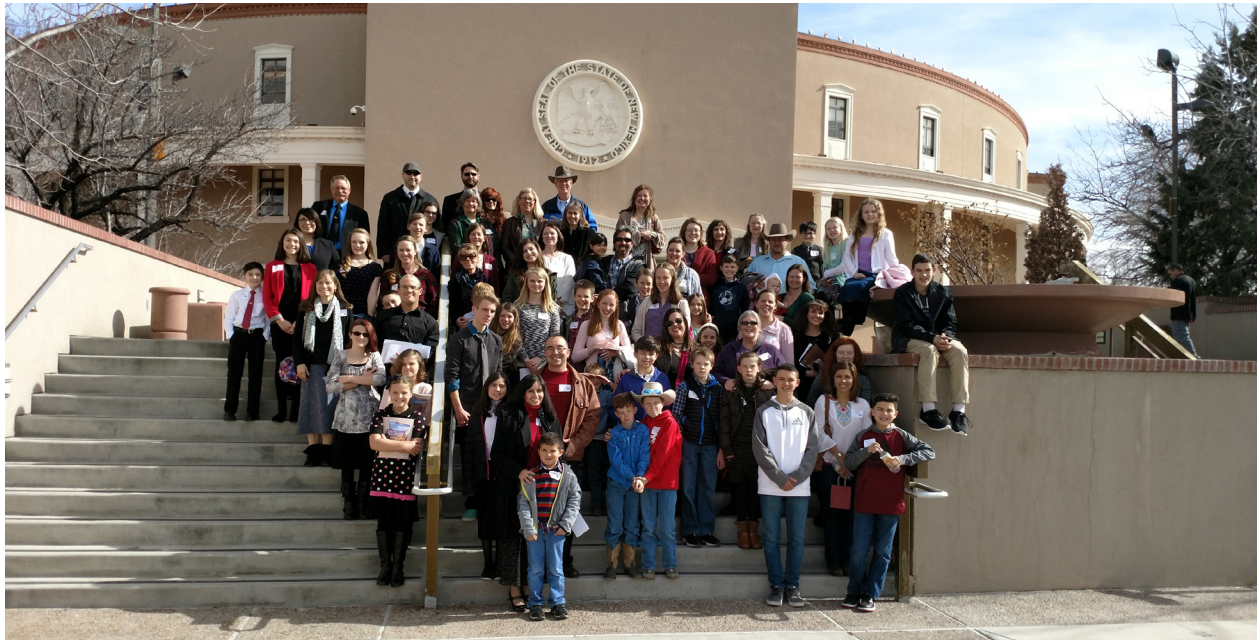
Families from around New Mexico gathered in Santa Fe to meet and greet their legislators and represent homeschooling at the 2017 CAPE at the Capitol Day.

Christian Association of Parent Educators - New Mexico P. O. Box 1506 Moriarty, NM 87035 Website www.cape-nm.org 505-898-8548 info@cape-nm.org